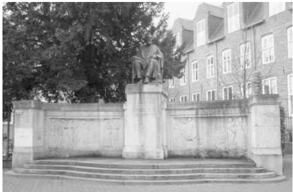
Hein Donders (GS 809)