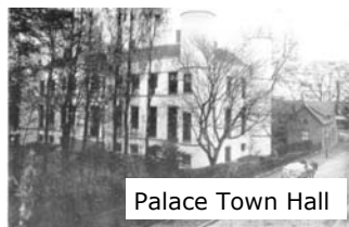
Palace Town Hall

was popularly named the meadow of the King. In 1864 this was given to the municipality of Tilburg. In 1966, the palace was reconstructed to a State High School. In 1935 this building was adapted and in 1936 it became the town hall.